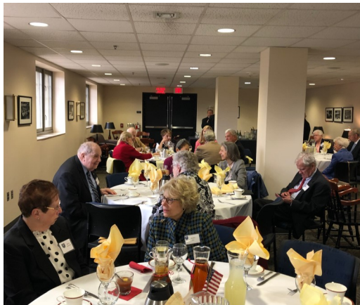
Top and bottom: VHS members enjoying the wonderful luncheon provided by VMI.