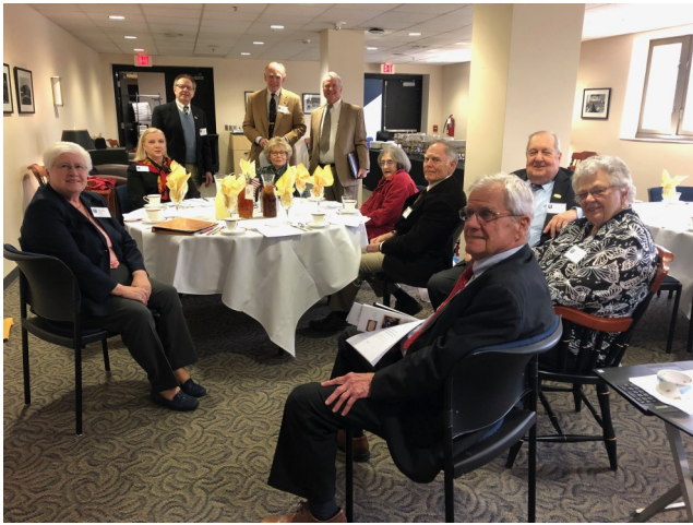
The VHS Council meets